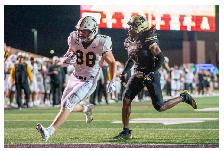
Oct. 8 - Bobcat Stadium - San Marcos, Texas - 25,613

At 3-3, App State has three losses through six games for the first time since starting 1-5 in 2014, its first season as an FBS member of the Sun Belt Conference.