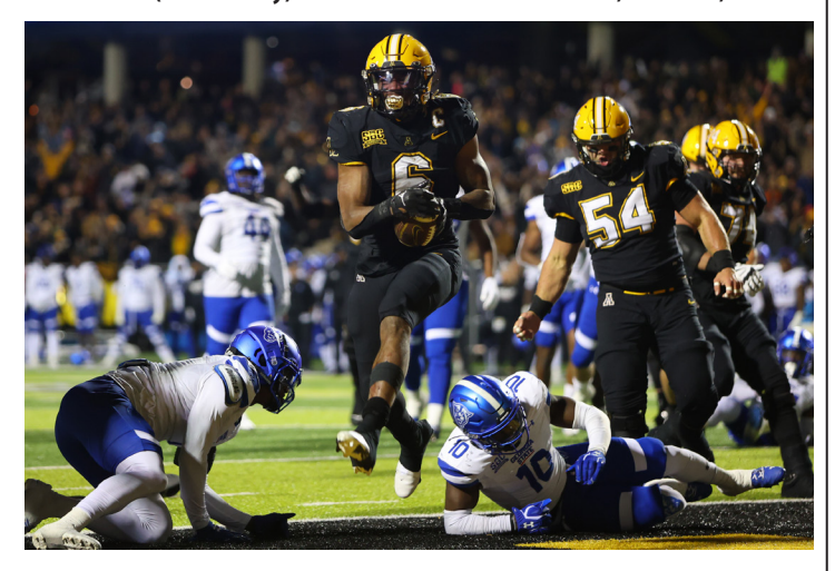
Oct. 19 (Wednesday) - Kidd Brewer Stadium - Boone, N.C. - 31,757

App State improved its record against Georgia State to 9-0 and its record in all games against Sun Belt teams since the 2014 transition to 58-13.