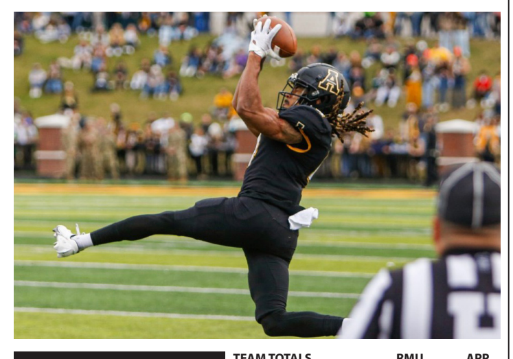
Oct. 29 - Kidd Brewer Stadium - Boone, N.C. - 32,501

In 100 games since the start of the 2015 season, App State improved to 78-22.