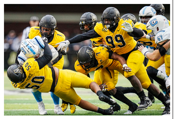
Oct. 1 - Kidd Brewer Stadium - Boone, N.C. - 30,789

It was App State's first home shutout since the 2015 opener against Howard (also 49-0) and the Mountaineers' seventh shutout since making the FBS climb in 2014. In addition to the three games noted so far, the other shutouts were 66-0 against Campbell (2014), 44-0 against Georgia State (2014), 49-0 against ODU (2015) and 24-0 against Louisiana (2016).