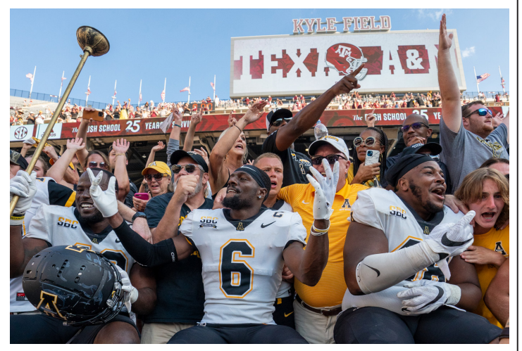
Sept. 10 - Kyle Field - Bryan-College Station, Texas - 92,664

App State secured its third ever win ove a top-25 ranked FBS opponent and its second in as many seasons. The other wins were the historic 34-32 upset at No. 5 Michigan in 2007 and last year's 30-27 home win over No. 14 Coastal Carolina