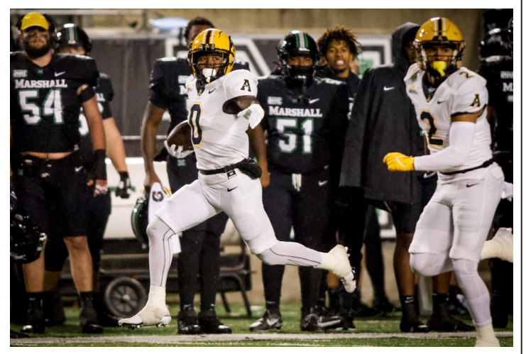
Nov. 12 - Joan C. Edwards Stadium - Huntington, W.Va. - 24,312

Marshall had a third-and-9 conversion and a third-and-10 conversion on its first drive. On its second scoring drive, a bubble screen on a third-and-18 pass from the Thundering Herd's 12 turned into a 71-yard gain.