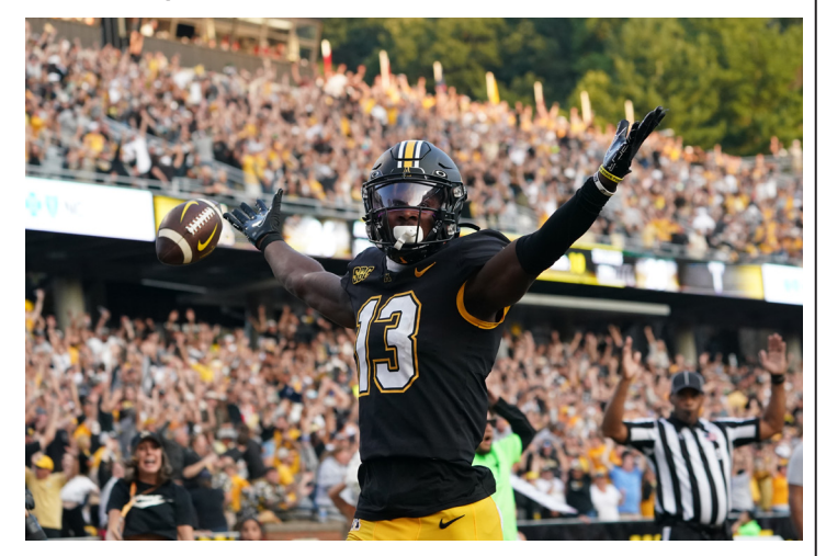
Sept. 17 - Kidd Brewer Stadium - Boone, N.C. - 34,406

The attendance of 34,406 for Troy's visit ranked as the fourth-biggest crowd in KBS history and the top crowd for a non-ACC foe. It was the biggest crowd to see an App State win at The Rock.