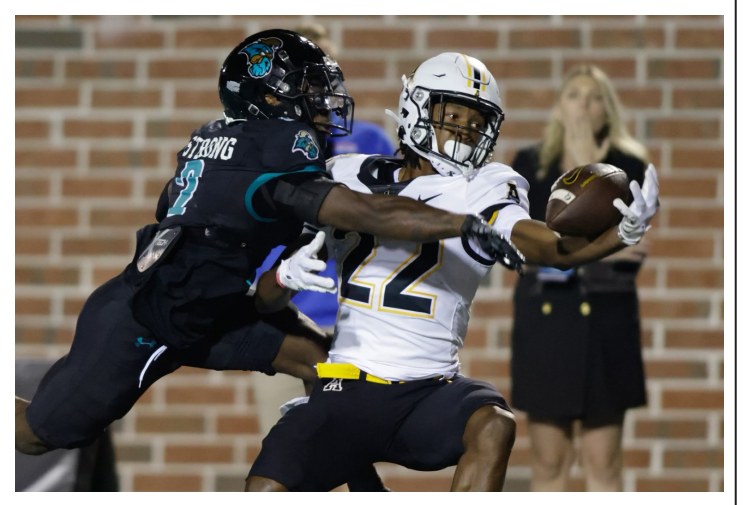
Nov. 3 - Brooks Stadium - Conway, S.C. - 21,224