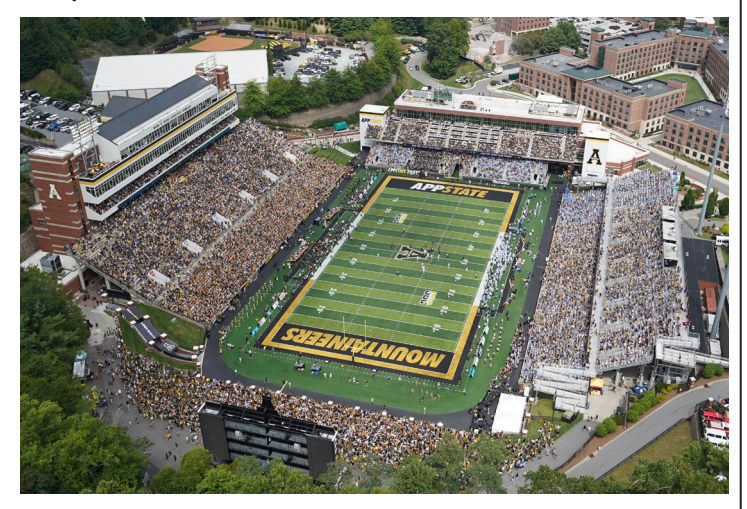
Sept. 3 - Kidd Brewer Stadium - Boone, N.C. - 40,168 (Stadium Record)