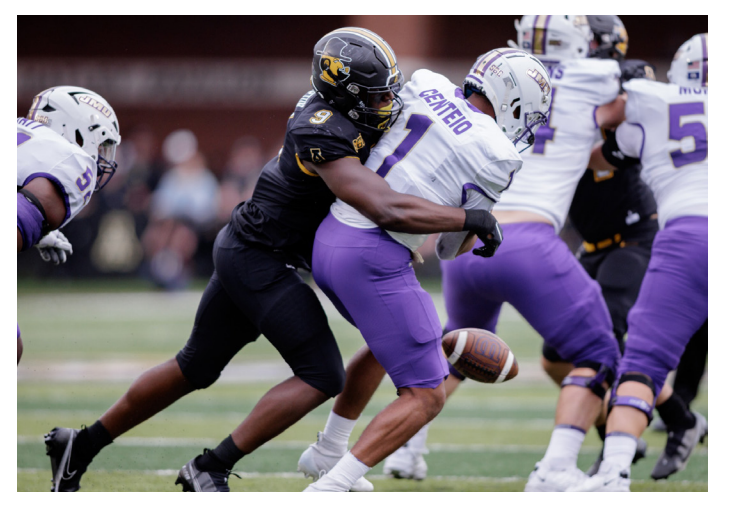
Sept. 24 - Kidd Brewer Stadium - Boone, N.C. - 33,248